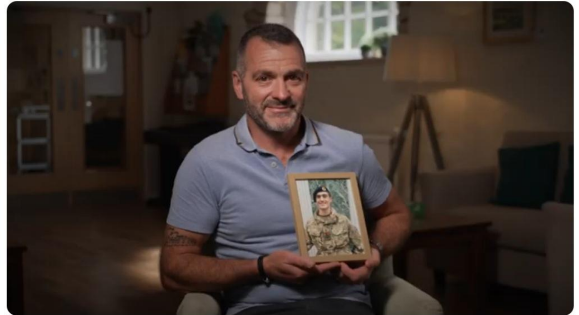
Take That Step - a film by The Compassionate Friends